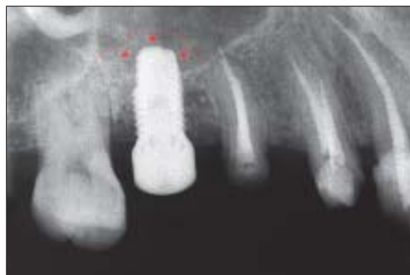
Fig 2 An immediate postoperative radiograph shows evidence of condensed bone around the implant and a light radiopacity indicative of the demineralized bone allograft (asterisks) placed at the apex of the implant. The dotted line indicates the displacement of the sinus floor.