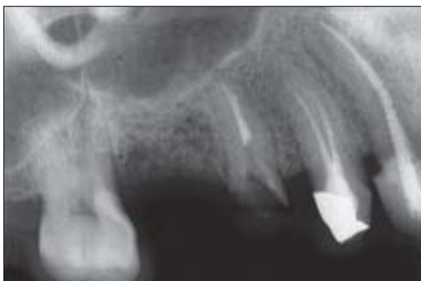
Fig 1 A preoperative periapical radiograph of the patient shows sufficient bone height for the OSFE procedure and immediate implant placement in the area of the maxillary right first molar.