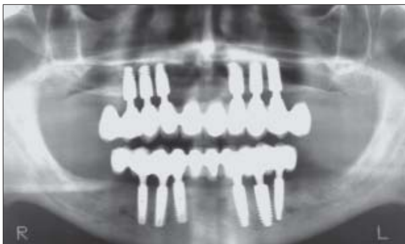
Fig 5 (Above) Radiologic evaluation of immediately loaded implants 3 years after loading.

T 0 = baseline; T 1 = placement of the definitive restoration; T 2 = final follow-up. PV = Periostest value; PPD = periodontal probing depth; KM = keratinized mucosa. Baseline was measured immediately after surgery for Periostest value and 2 weeks after surgery for all other variables.