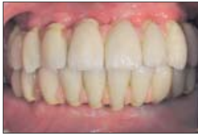
Fig 4 A definitive restoration in occlusion.