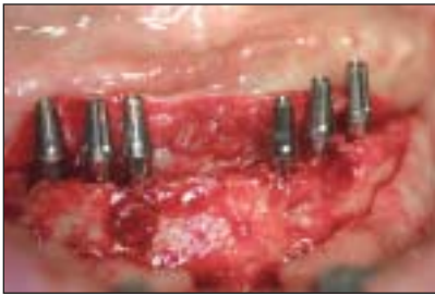
Fig 1 Implant placement and abutment connection for immediate loading.