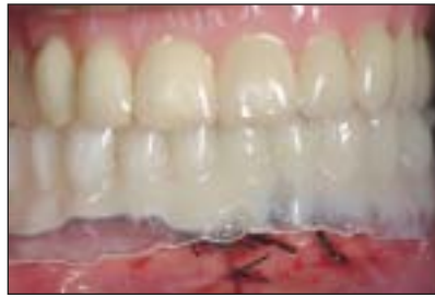
Figs 2 and 3 A provisional prosthesis fabricated chairside for immediate occlusal loading.