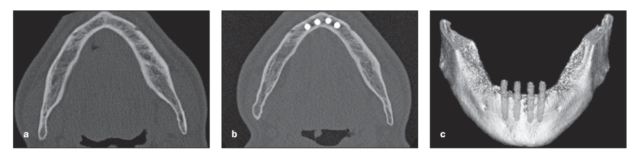
Figs 1a to 1c (a and b) Pre- and postoperative CT scans of a 63-year-old male patient. (c) A 3-dimensional rendering of the postoperative CT scan with implants in place.

The VISIT navigation system<sup>6,9–11</sup> is an experimental navigation device specially designed for implant dentistry. For comparison, the commercial Stealth-Station Treon, a neurosurgical navigation system, was adapted for dental implant placement. The difference between the navigation systems lies in the user interface and the tracking systems. Their accuracy is primarily defined by the CT data<sup>11</sup> and the registration procedure.<sup>16</sup>