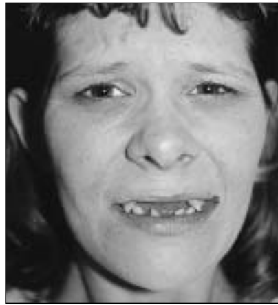
Fig 1a (Left) Pretreatment distress of the patient in dental pain.