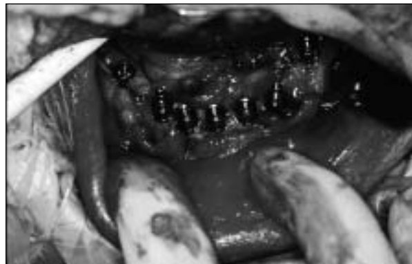
Fig 2 Alveolar debridement and implant and abutment surgery for stage 1 of treatment.

bone. Eight Brånemark System implants (Nobel Biocare USA, Yorba Linda, CA) were placed: five 3.75 \times 18 -mm implants in the anterior mandible and three 4 \times 10 -mm implants in the posterior mandible (2 in the right and 1 in the left). The bone quality at the time of implant placement was determined clinically by the surgeon 11 to be quality 2 according to the classification established by Lekholm and Zarb. 12 A tap was used to prepare threads in the osteotomy sites prior to implant placement. Immediately following implant placement, a combination of Brånemark System abutments (Nobel Biocare USA) were securely fastened: two 3-mm Esthetic-Cone abutments were used in the positions of the mandibular left canine and right first molar, while 3-mm and 4-mm standard abutments were used for the remaining implants (Fig 2).