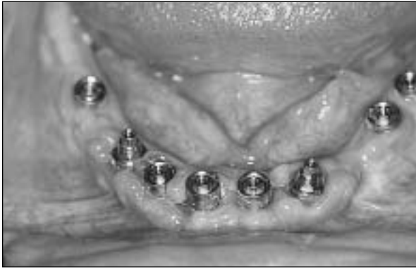
Fig 5a Healed mucosa around abutments 4 months after stage 1 surgery.