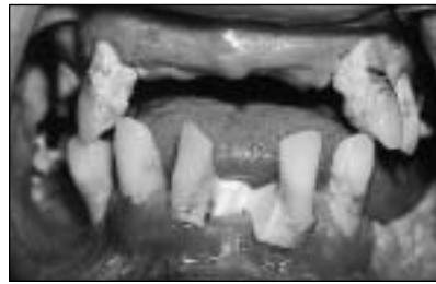
Fig 1b (Below) Pretreatment clinical view showing advanced periodontitis, missing teeth, and angular cheilitis from lost vertical dimension.