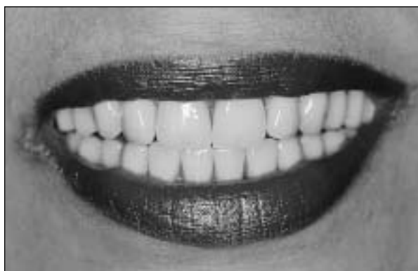
Fig 4 Facial view of provisional restorations immediately following surgery.

screws. Rubber dam (Hygenic; Coltene/Whaledent, Mahwah, NJ) was then placed over the surgically closed mucosal tissue to protect it from the autopolymerizing acrylic resin (Jet Acrylic; Lang Dental, Wheeling, IL) used to connect the prosthetic cylinders to the complete mandibular denture using the conversion prosthesis protocol. 13,14 Once polymerization of the resin was complete, the guide pins were removed from the prosthesis. The prosthesis was then taken from the operating room to the laboratory to be structurally enhanced, refined, and polished.