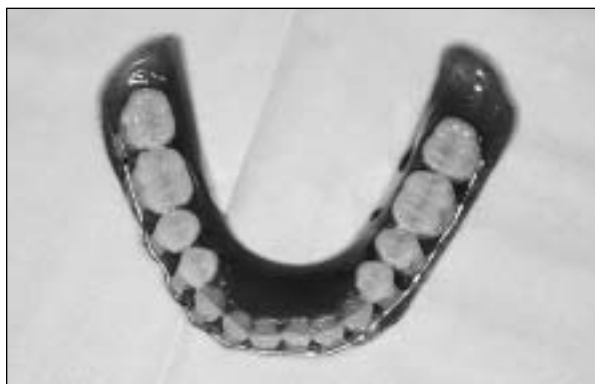
Fig 3a Mandibular immediate denture with labial wire reinforcement.