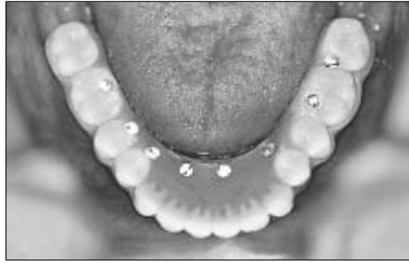
Fig 5b Second visit 4 months after stage 1 surgery; delivery of definitive prostheses.