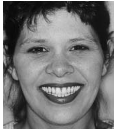
Fig 5d Patient response to treatment.

COPYRIGHT © 2002 BY QUINTESSENCE PUBLISHING CO. INC. PRINTING OF THIS DOCUMENT IS RESTRICTED TO PERSONAL USE ONLY. NO PART OF THIS ARTICLE MAY BE REPRODUCED OR TRANSMITTED IN ANY FORM WITHOUT WRITTEN PERMISSION FROM THE PUBLISHER.