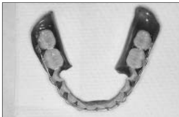
Fig 3b The mandibular immediate denture is relieved for a "pickup" impression of prosthetic components.