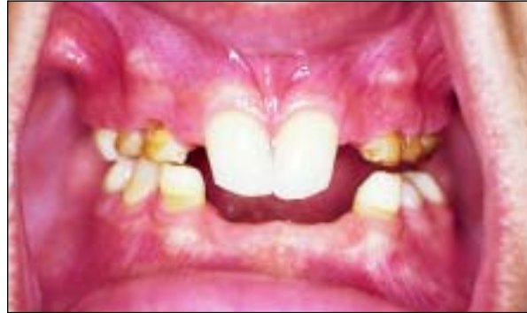
Fig 2 Permanent maxillary central incisors and the residual primary dentition.