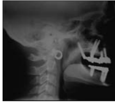
Fig 5b Postoperative lateral cephalometric radiograph.