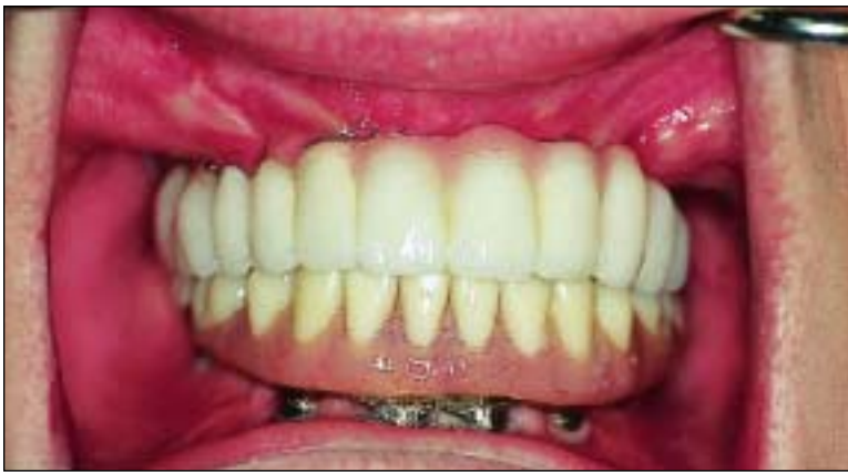
Fig 6a Postoperative intraoral frontal view.