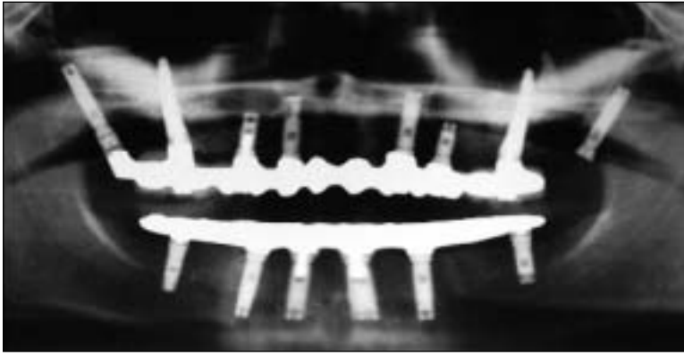
Fig 5a Postoperative panoramic radiograph.