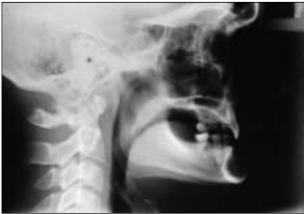
Fig 3 Loss of alveolar bone and severe collapse of the vertical dimension of occlusion are visible in the preoperative lateral cephalometric radiograph.

implants to support nonremovable teeth, bone grafting and tissue engineering, and advanced prosthodontic procedures. The following patient study is presented to illustrate the biomechanical and esthetic advantages of implant-related prosthodontic orofacial rehabilitation for an ED patient.