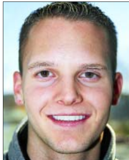
Fig 6b (Right) The functional implant reconstruction and soft tissue support resulted in a pleasing full-face smile.

Decadron cortical steroid (Merck, West Point, PA), and pain medication for the first 48 hours after the implant placement surgery. The patient was also advised to use Peridex antimicrobial mouthwash (Zila Pharmaceuticals, Phoenix, AZ).