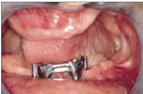
Fig 3 Intraoral view of the implants and bony-mucosal support for the overdentures.